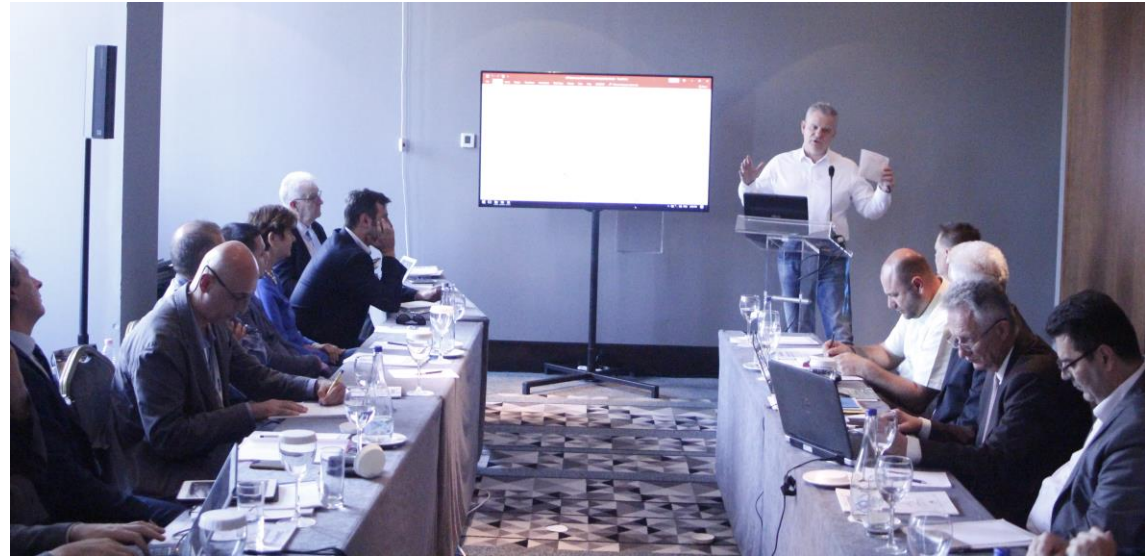
Workshop " SEENET National Welding Capability "