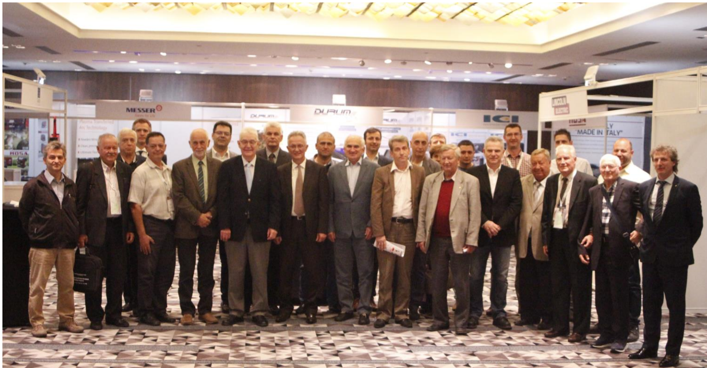
Participants of the " SEENET National Welding Capability " Workshop

On October 10 th , a very successful IIW WG-RA Workshop " SEENET National Welding Capability " was held. The main objective was to identify key areas of co-operation and collaboration which could be undertaken between SEENET countries in order to improve further activities.